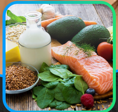
Fresh & Healthy