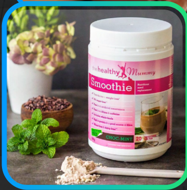
Health & Fitness