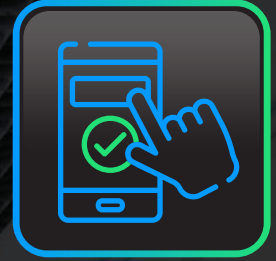
QR Code Check out